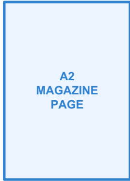
420 × 594 mm 4961 × 7016 px